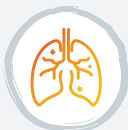
Respiratory tract infection