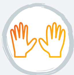
Swelling of lower legs or hands